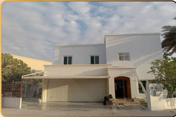
Project: Villa Extension Project Meadows 2 Street 6 Villa No. 11, Dubai