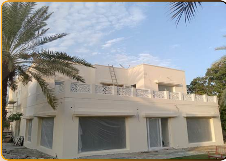
Project : Villa Extension Project Meadows 2 Street 6 Villa No. 11, Dubai