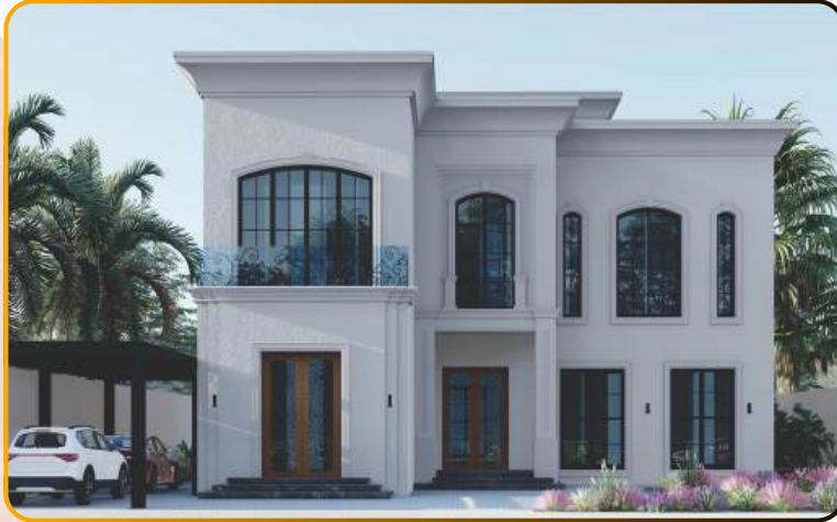
Project : Proposed G+1+R Villa at Plot No. 7111-3174 Al Awir 1 ST , Dubai