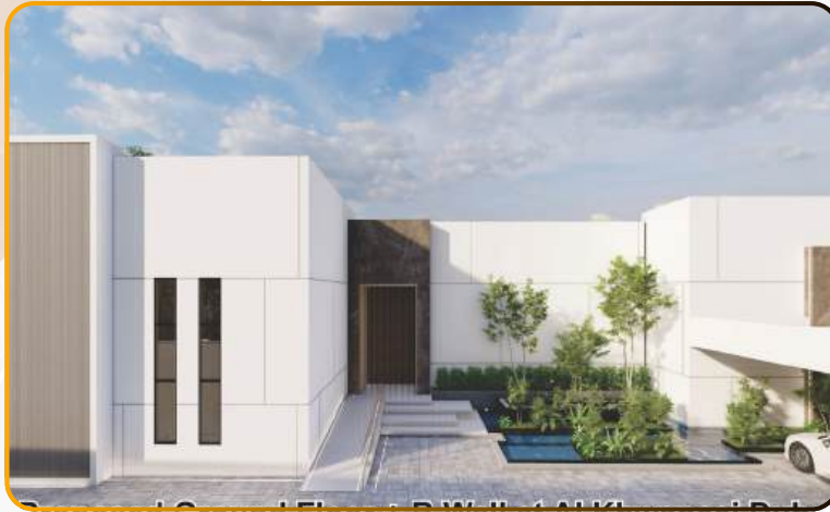
Project: Proposed Ground Floor Villa at Plot No. 282-5585 Al Awir 1 ST , Dubai