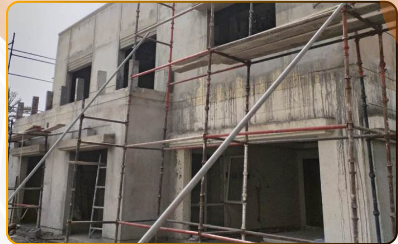
Project : Villa Extension Project at Arabian Ranches, Dubai