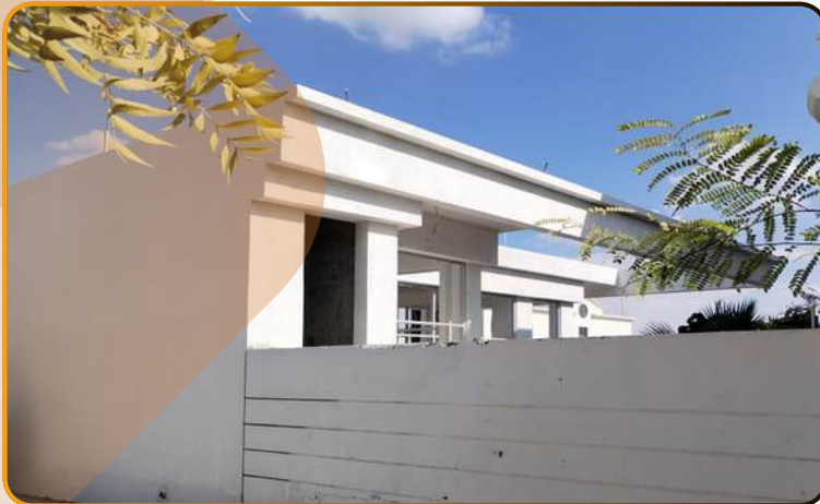
Project: Proposed Majlis Block at Plot No. 363-0642 Al Manara , Dubai