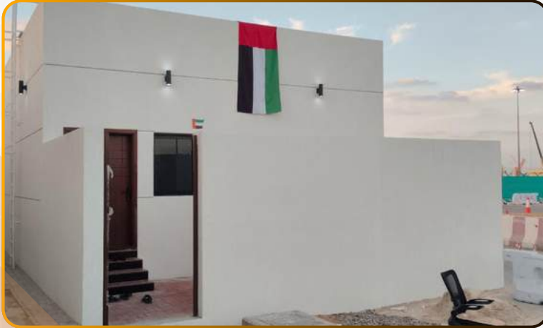
Project : Addition of Imam Residence at Plot No. 131-0103, Al Wahida Mosque, Al Hamriya Port , Dubai