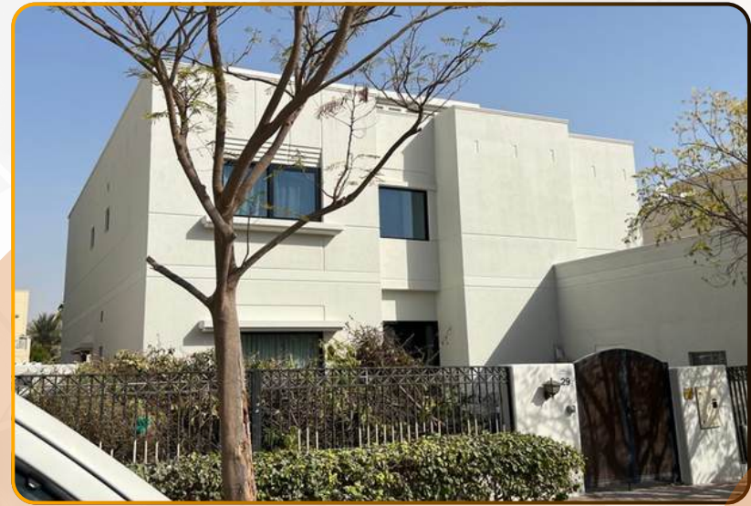
Project : Villa Extension Project Meadows 9 Street 9 Villa No. 29, Dubai