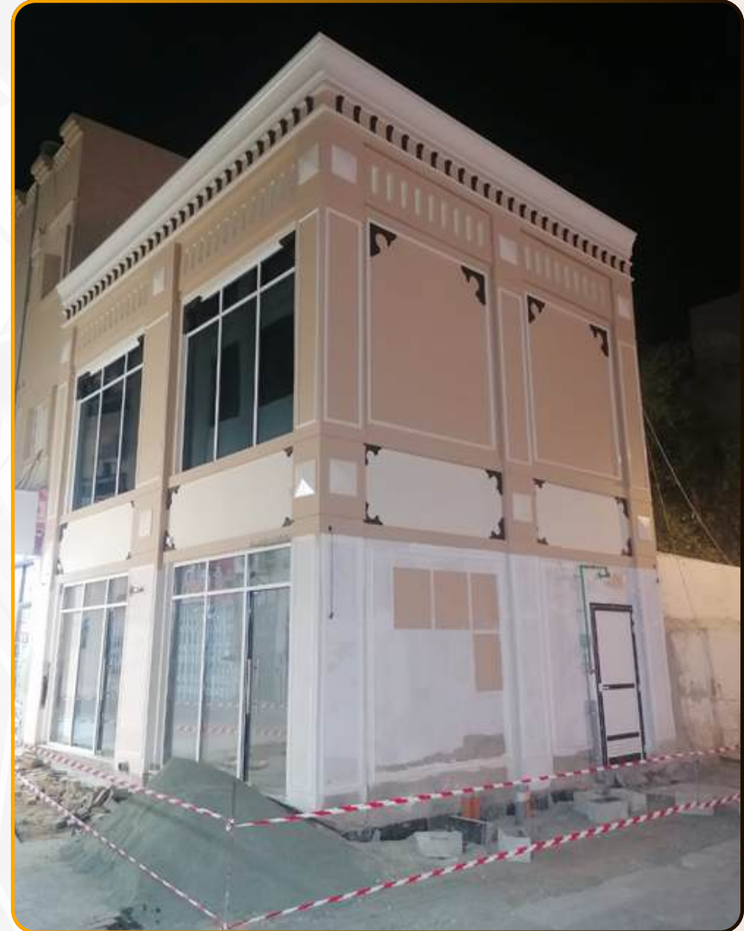
Project : G+M Development project at Plot No. : 113-0189 Naif Gold Souk, Dubai