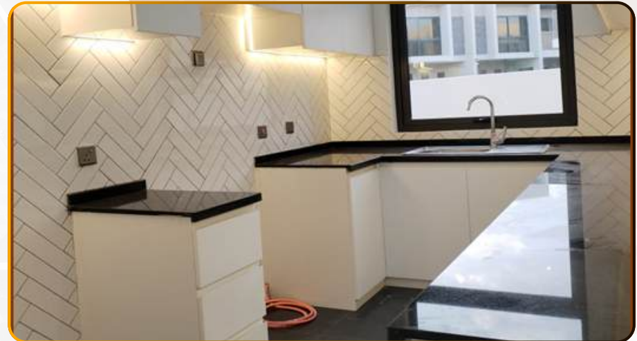
Project : Villa Complete Interior Work at 393 ZINNIA, DAMAC HILLS 2, DUBAI