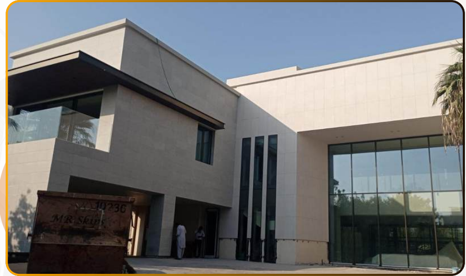
Project : Exterior Tiles/Marbal Cladding & Hardscaping Work at V3 Emirates Hills , Dubai