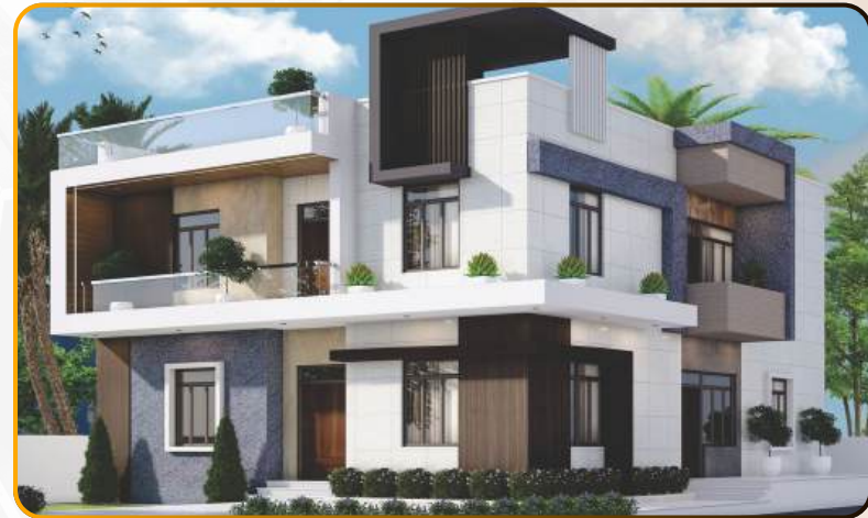
Project : Proposed G+1 villa with Roof Top at Danta