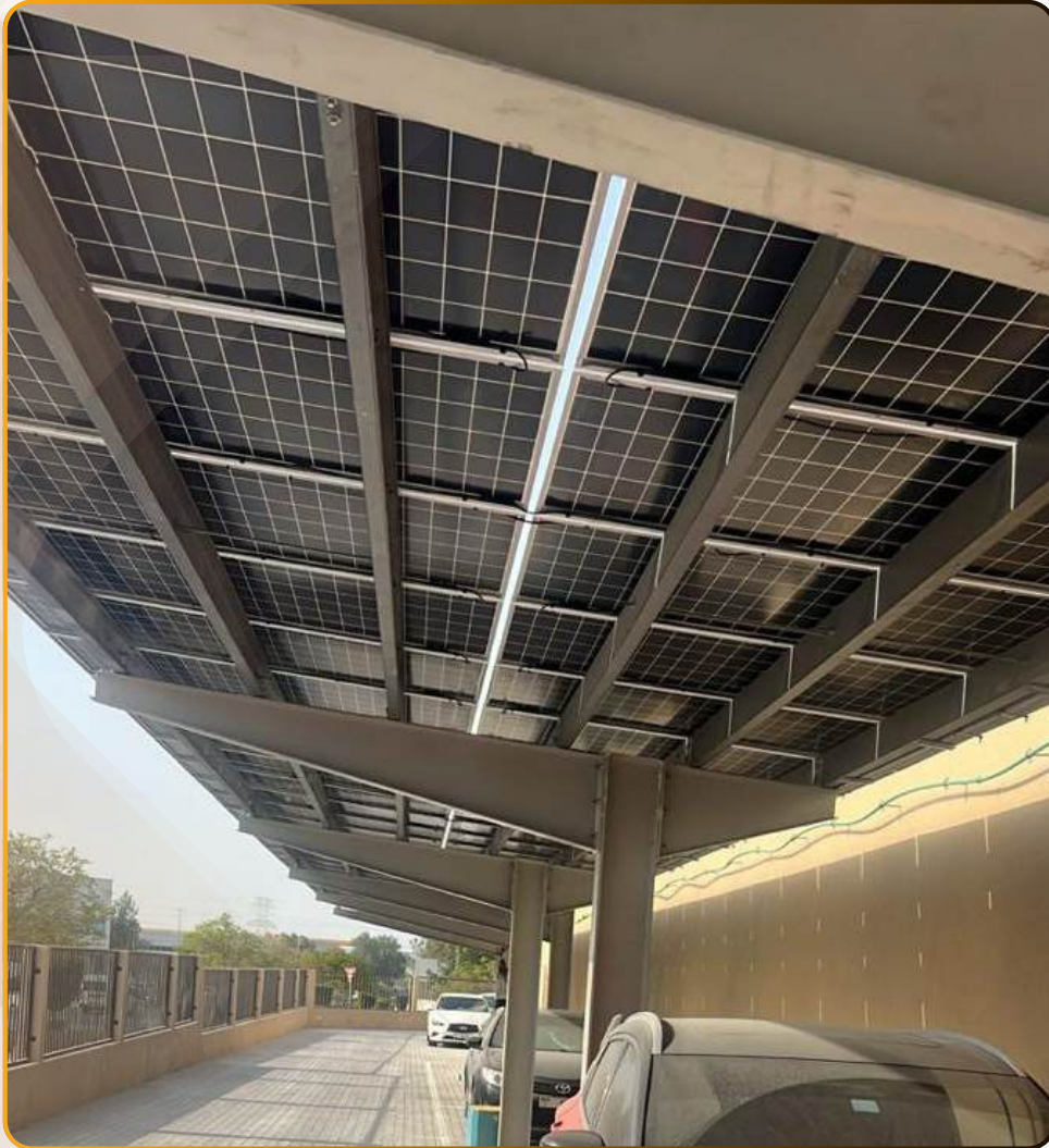
Project: Proposed Civil & Solar Car Park Shed at AMICO , DIP, Dubai