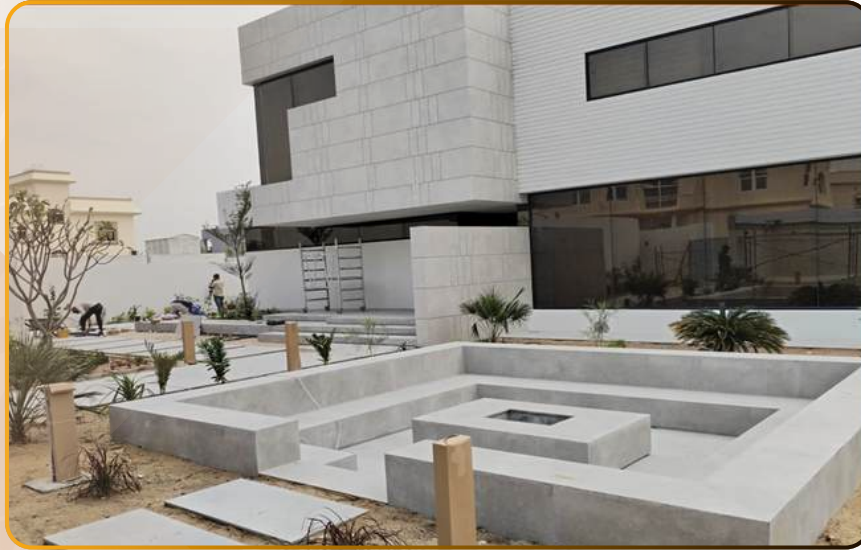
Project : Exterior Tiles Cladding & Hardscaping Work at Al Mizhar, Dubai