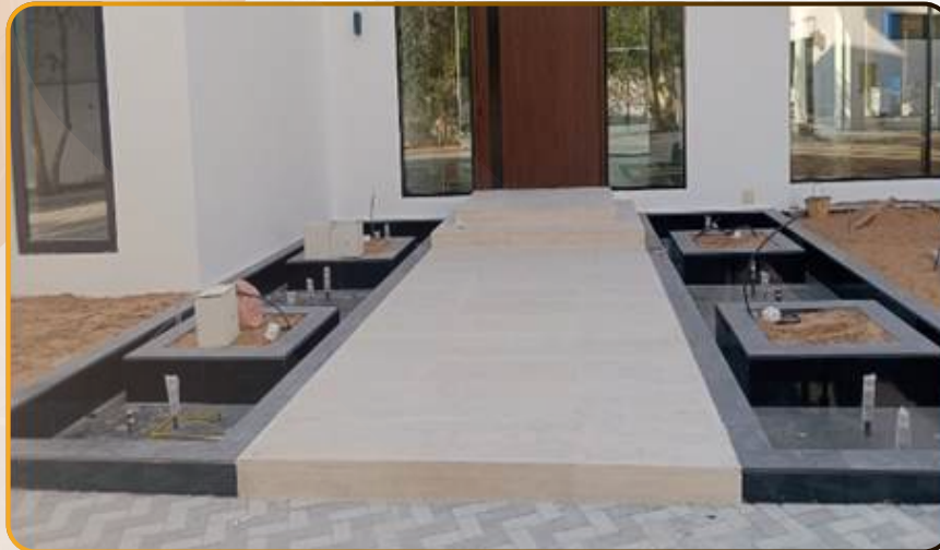
Project: Marbel & Hardscaping Work at Al Barari, Dubai